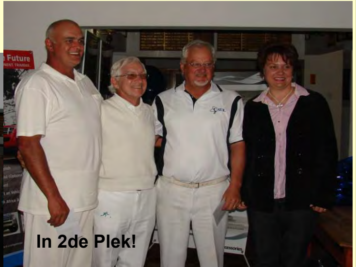
In 2de Plek!