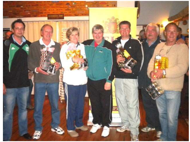
Die wenspan—Fiat & Alfa