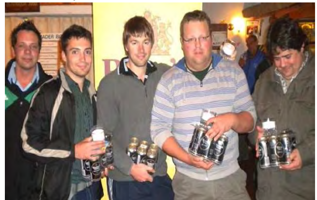
Die Goons was tweede