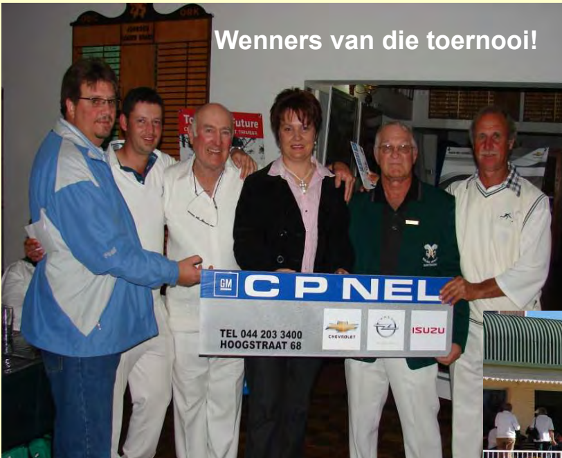
Wenners van die toernooi!