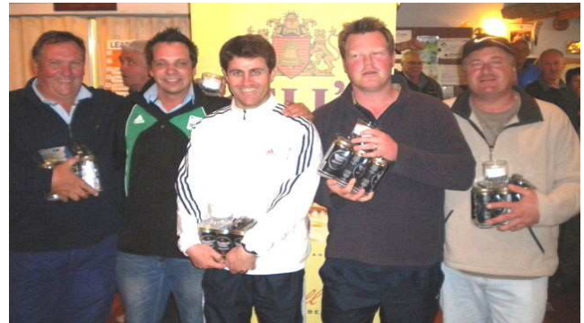
Die Vintage Rollers het in die 3de plek geëindig