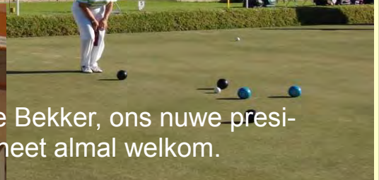
In die 3de Plek!