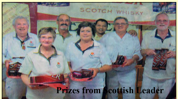
Prizes from Scottish Leader